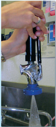
Pre-rinse kitchen sprayer