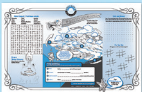
Water efficiency kid's activity placement and crayons