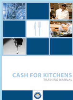
Cash for Kitchens training manual